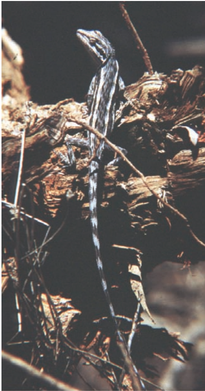
Figure 1. Caimanops amphiboluroides .

presumably foraging, one was under a small bush in the shade, another was in the open shade and ran to a clump of grass, a third was in the open sun and walked to open shade, then ran to the edge of open sun/shade.