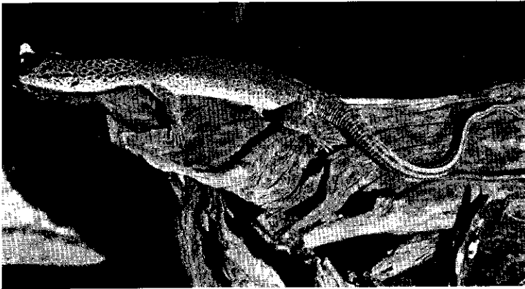
Fig. 1—Subadult female Varanus caudolineatus from 16 miles south of Atley HS, W.A. The dorsum is buffy grey-brown with scattered spots of darker brown. The ground colour of the tail is grey with markings of dark-brown; proximally the tail is spotted, distally it becomes longitudinally striped. Head greyish, speckled with numerous small dark-brown spots, and with a dark-brown stripe behind the eye. Ventrally a pale cream colour with some speckling of small dark-brown spots, especially beneath the throat.

(Nannine, via Meekatharra); WAM R13137 (No. 5 tank, NW Hwy; 150 m. N. Northampton); AM R3057, R12460 ("Perth"); WAM R21149 (22 m. N. Sandstone); WAM R21150 (32 m. SW. Sandstone); WAM R13711 (Shark Bay turn-off, Great Northern Hwy.); WAM R4288 (Tambrey HS); WAM R12159 (Tardun); WAM R25149 (2 m. SE. Turee Creek); WAM R27231 (Wanjarri Stn., Kathleen Valley); WAM R28028 (Weld Spring); WAM R21137 (15 m. SW. Wiluna); WAM R21138-39 (44 m. SW. Wiluna); WAM R3818 (Wurarga); WAM R1191, R4732, R4733, R8168, R22870 (Yalgoo); SAM R3448 (Yande Yarra); WAM R21100 (20 m. NE. Yelma Hstd.); WAM R21178-81 (7 m. SW. Youanmi); ERP 10606 (35 m. SW. Youanmi). Literature records: Champion Bay, Nannine Co., Cadoux, and Tardun (Mertens, 1958).