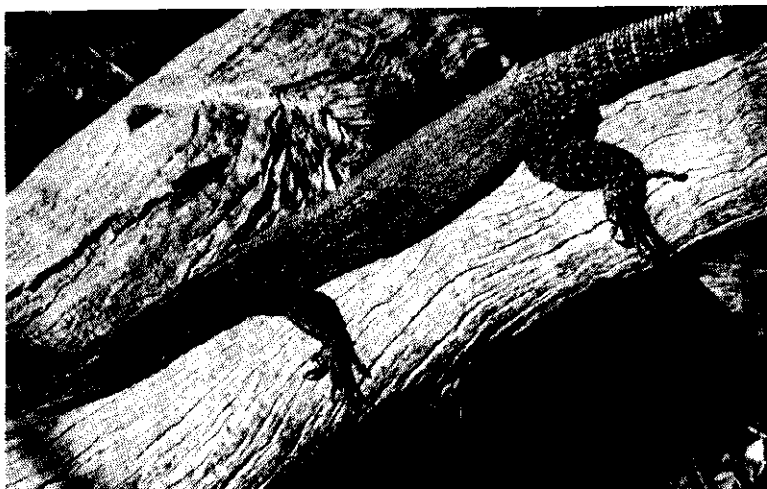
Fig. 1.—An adult male Varanus tristis from 24 miles east of Laverton, W.A. The head, forelegs, and distal parts of the tail are nearly pitch black. The dorsum and anterior parts of the tail are a speckled mixture of grey, beige, yellow and pink. When held, the lizards maintain a very stiff posture.

Varanus tristis , commonly called the "Mournful" or "Racehorse" Goanna, is a medium-sized arboreal monitor lizard (Fig. 1). Although the species is widespread, occurring virtually throughout Australia, rather little has been reported about its biology. Two races are currently recognized, a nearly pure black form, tristis , and a paler and more colourful inland race, orientalis (described by Fry, 1913). It has been thought that V. tristis tristis is confined to south-western W.A., while V. t. orientalis ranges across