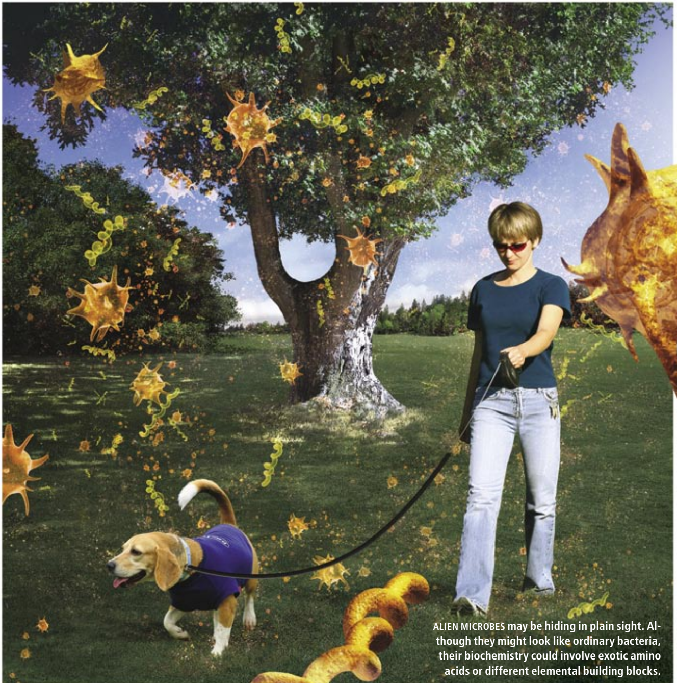
ALIEN MICROBES may be hiding in plain sight. Although they might look like ordinary bacteria, their biochemistry could involve exotic amino acids or different elemental building blocks.