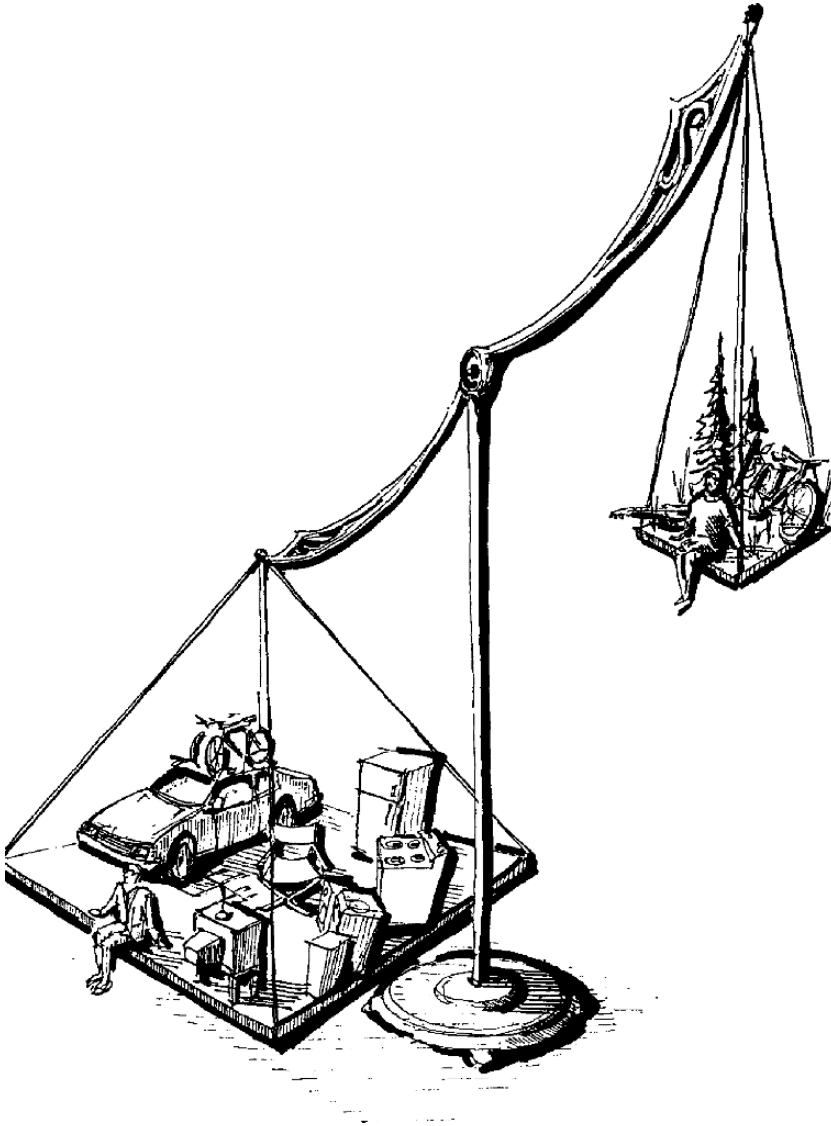
Fig. 3 Ecological inequity. In today's ecologically overloaded world, we all compete for the finite natural income flows produced by the ecosphere. The high money incomes and excessive consumption of affluent countries extends their ecological footprints into ecological space that could otherwise be occupied by the poorer nations. Even within countries, footprint sizes vary significantly as income disparity increases ( Source: Wackernagel and Rees 1995 )

global development, one that increases interregional dependence on vital natural income flows that may be in jeopardy, make ecological or geopolitical sense? If the answer is "no," or even a cautious "possibly not," circumstances may already warrant a restoration of balance away from the present emphasis on global economic integration and interregional dependency toward enhanced ecological independence and greater intraregional self-reliance. (If all regions were in ecological steady-state, the aggregate effect would be global stability.)