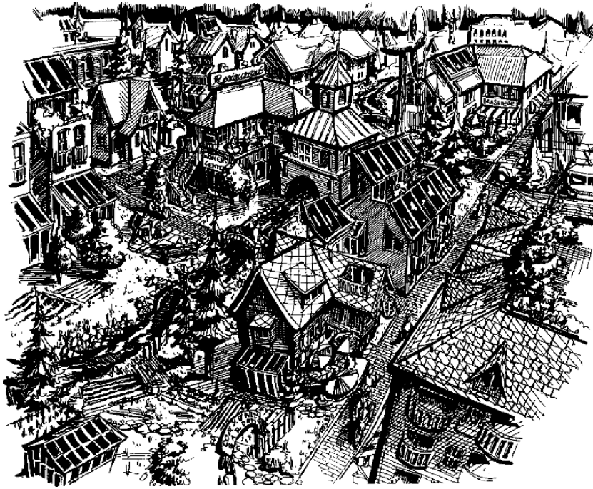
Fig. 4 The urban sustainability multiplier. High density urban living significantly shrinks our per capita ecological footprints by reducing our energy and material needs. We may also find that through improved urban design, our cities can become more accessible and community-oriented places that are safer and healthier for their residents

(including, perhaps, learning to live more simply, that others may live at all). Fortunately, ecological footprinting can be use to monitor general progress toward sustainability.